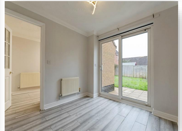
Woodcock Rise, Brandon, IP27 0BN