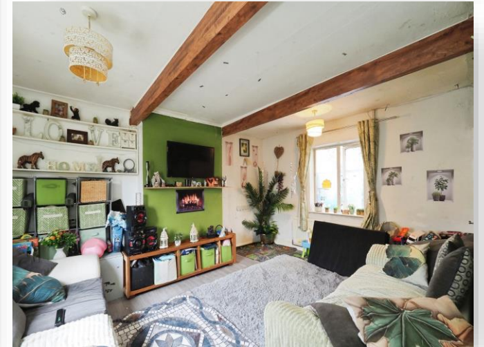
Woodthorpe Avenue, LOUGHBOROUGH