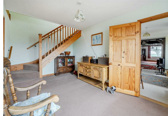
Sitting Room 14'9 x 12'6 (4.50m x 3.81m)