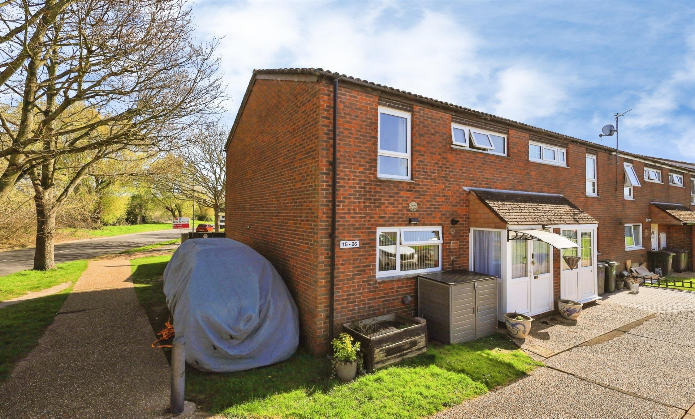
Fountains Close, Eastbourne BN22 0UG