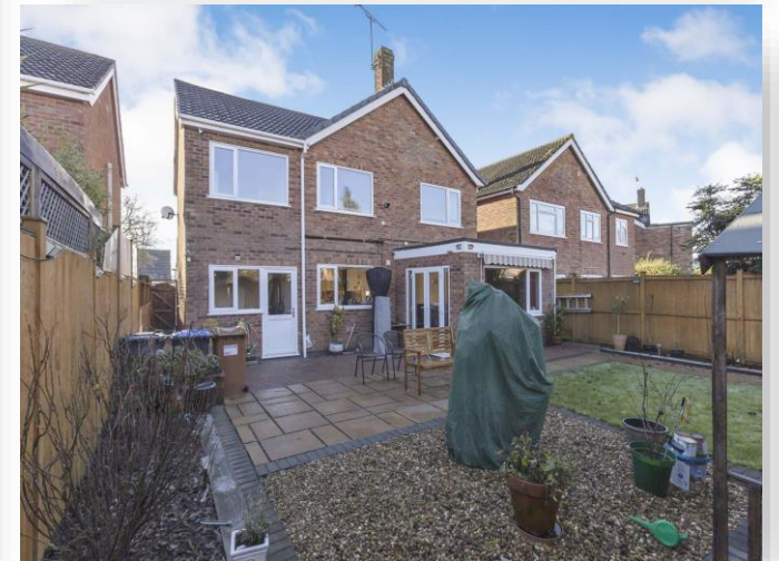
Barbara Avenue, Newbold Verdon LEICESTER LE9 9NS