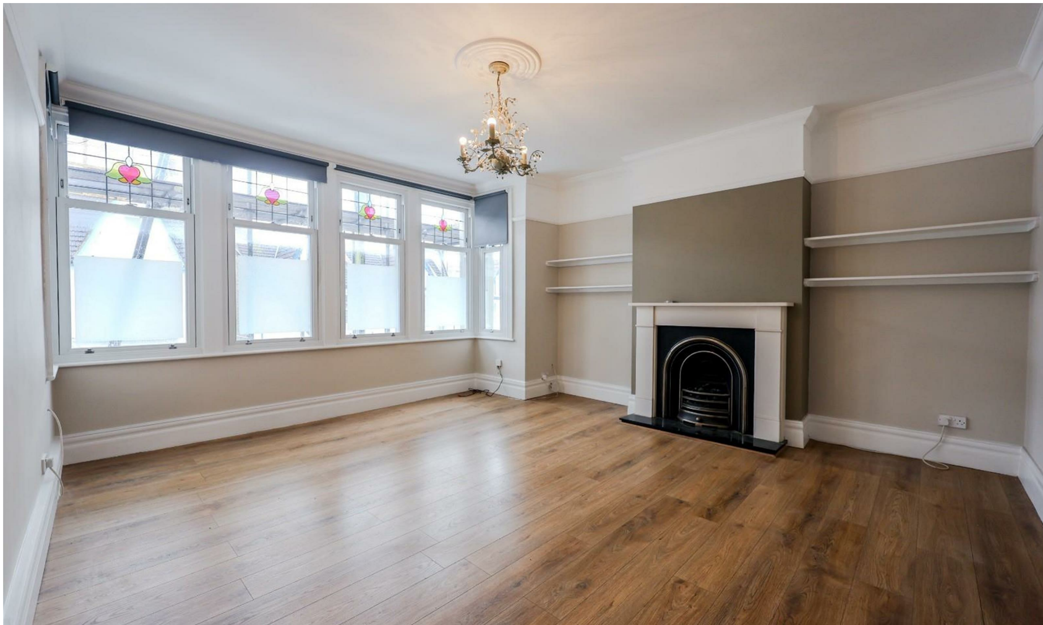
Leigh Hall Road, Leigh-On-Sea Offers Over £250,000