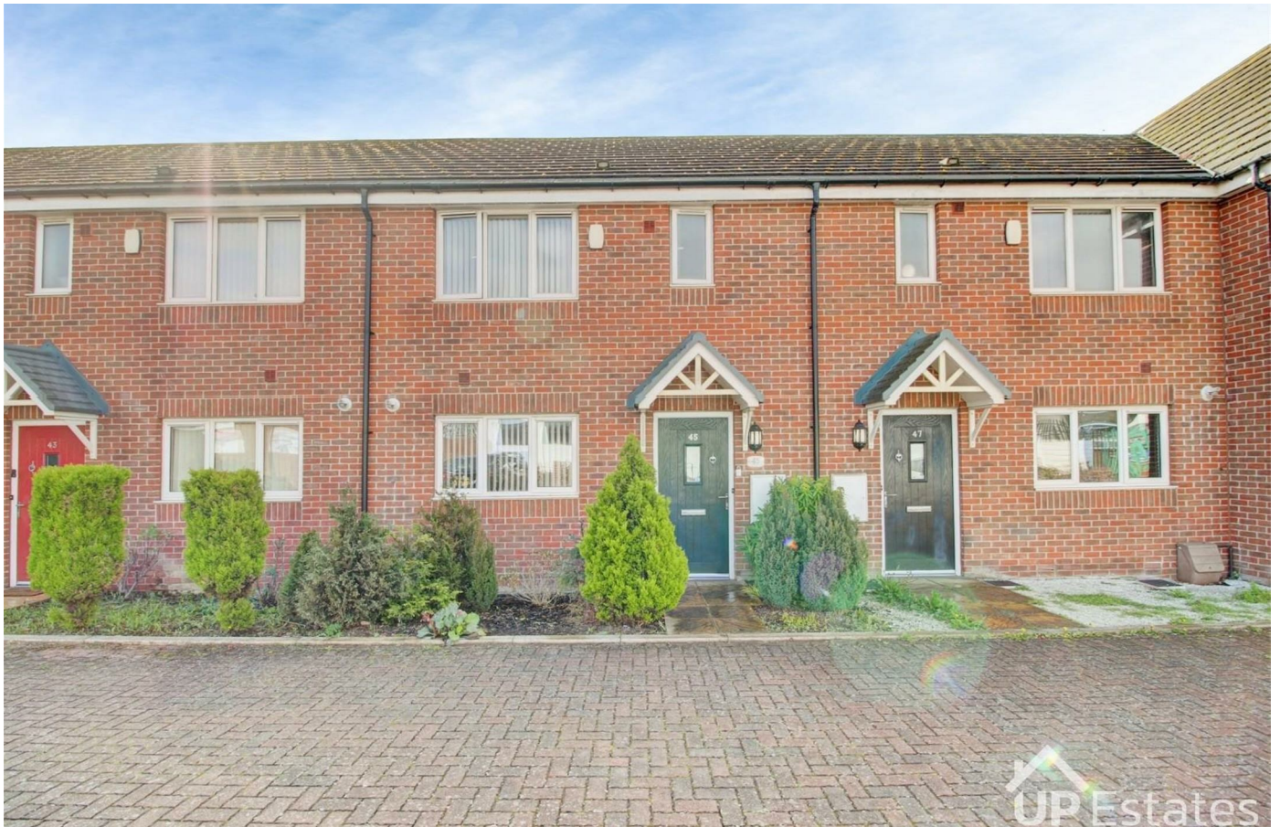
Kingfield Road, Coventry