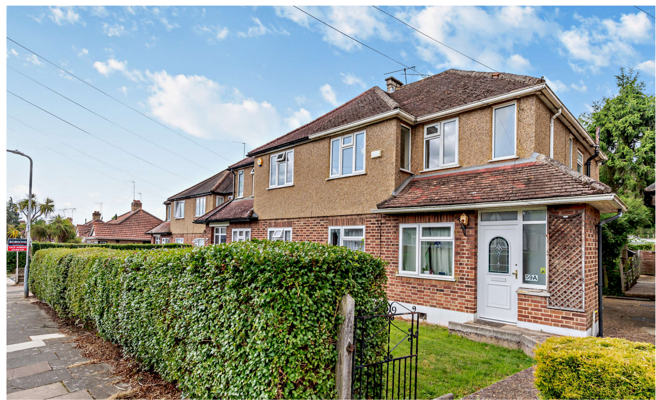
A two bedroom first floor maisonette ideally situated Alandale Drive, Pinner, HA5 3UX