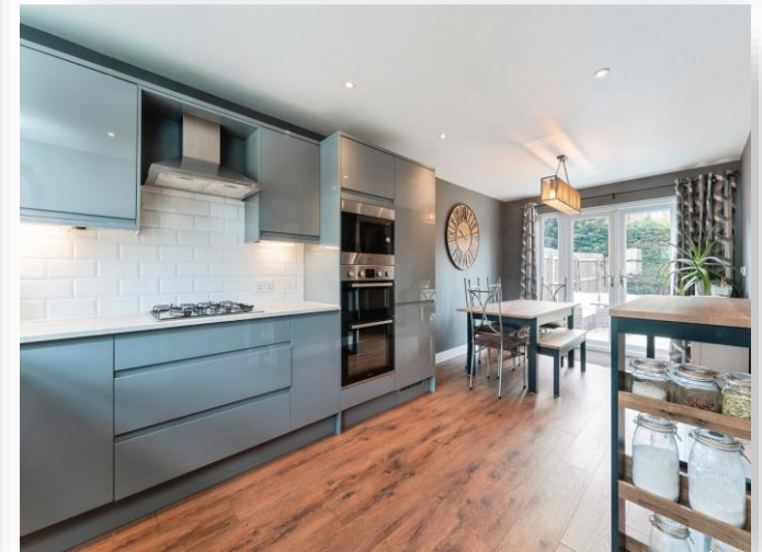
Chapel Lane, Chatteris PE16 6RJ