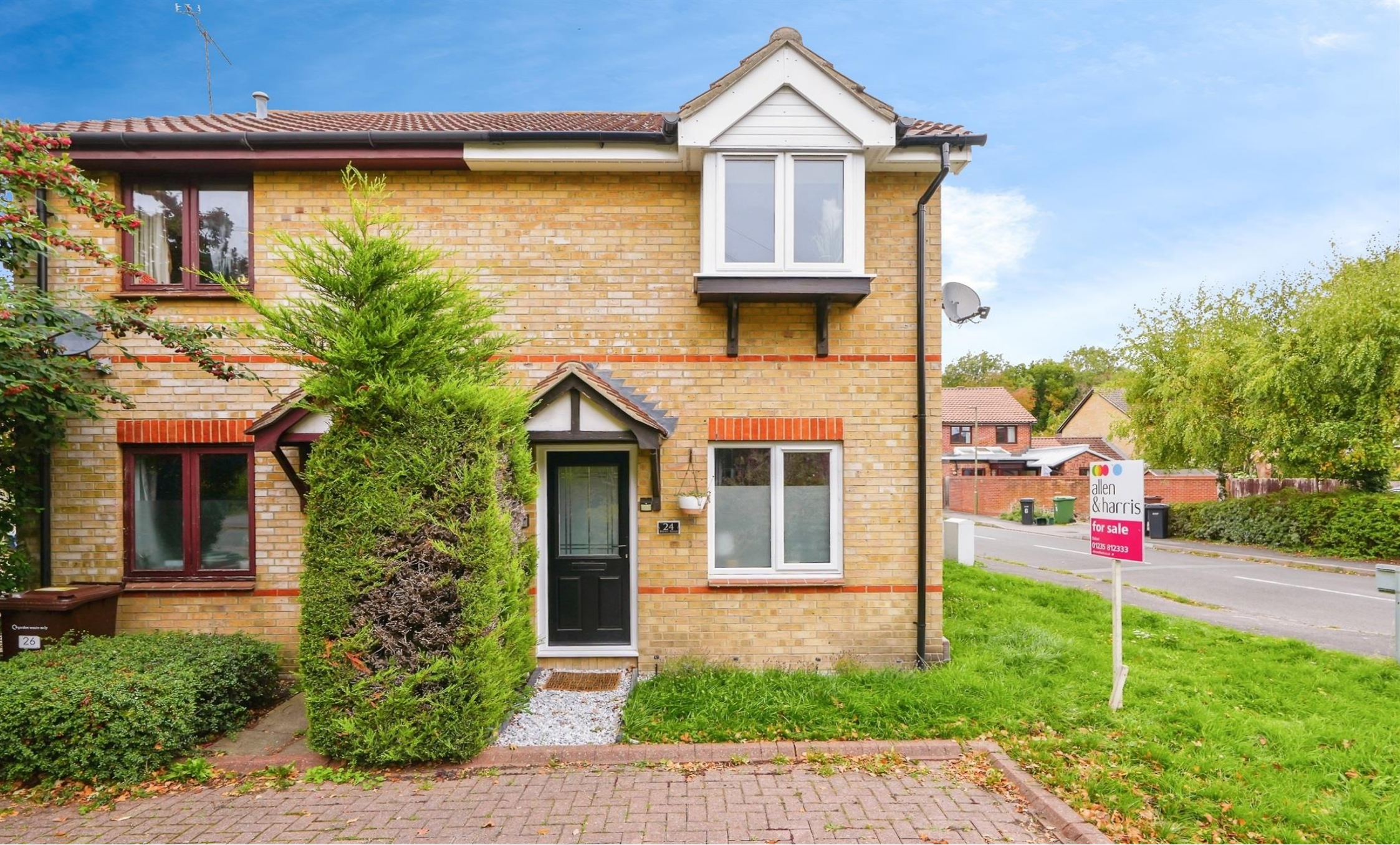
Trent Road, Didcot, OX11 7RD