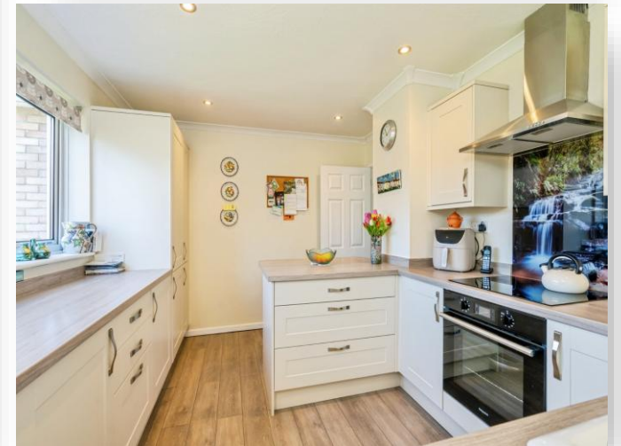
Ivy Close, Westergate Chichester PO20 3RF