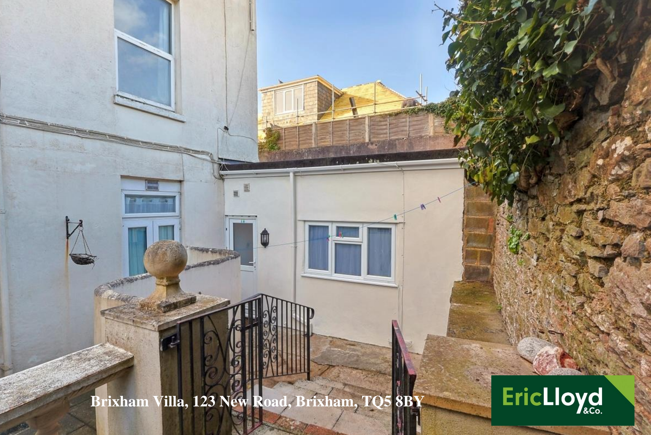
Brixham Villa, 123 New Road, Brixham, TQ5 8BY