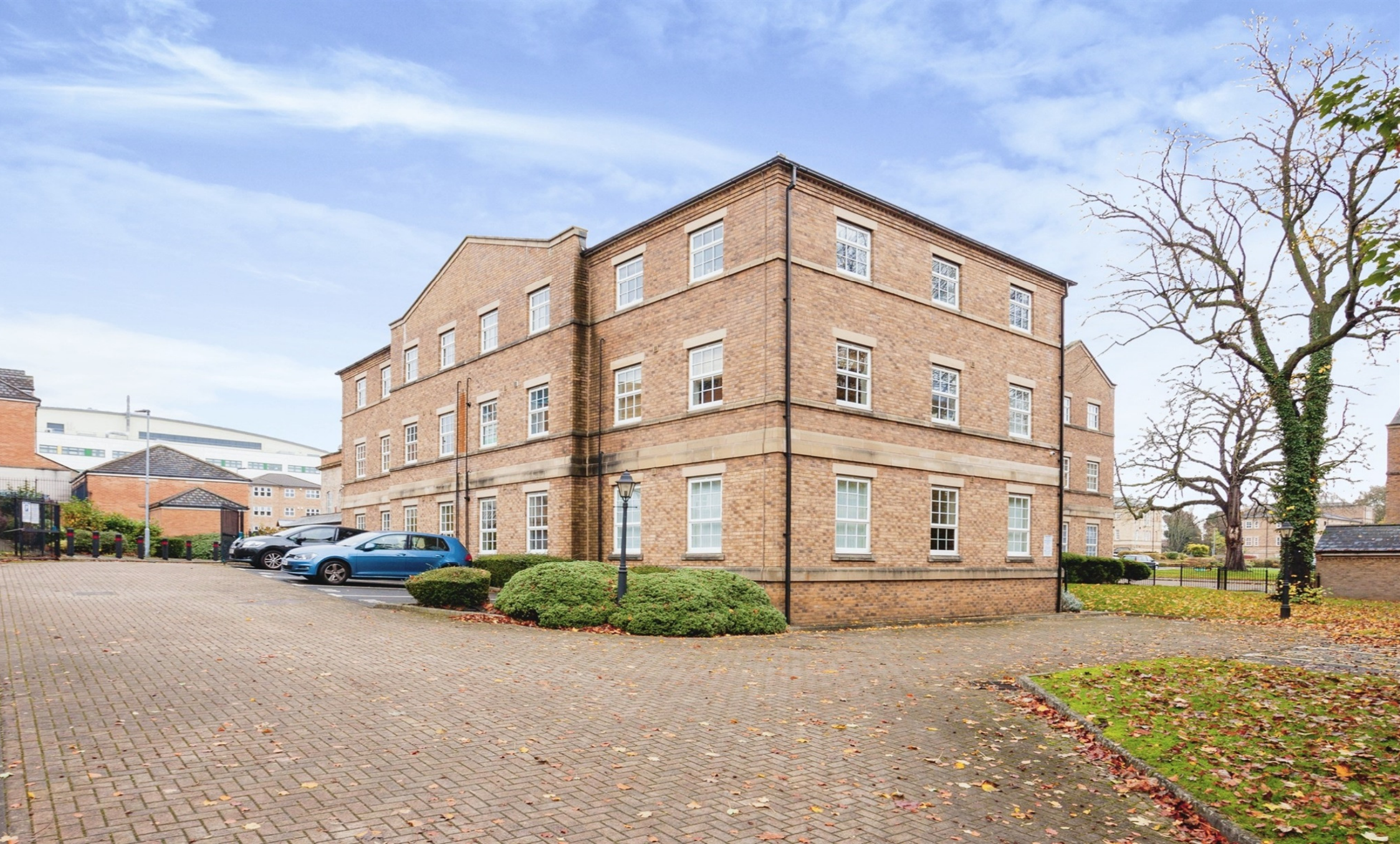
Birch House Chaloner Grove, Wakefield WF1 4ST