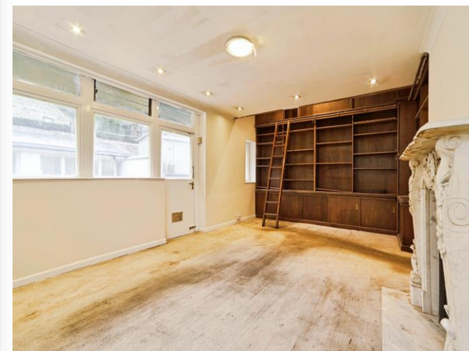
Park Drive, Bradford BD9 4DR