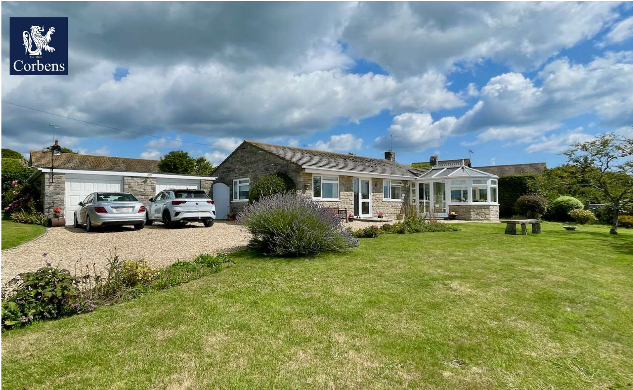
WILLOW COTTAGE, WINSPIT ROAD, WORTH MATRAVERS £725,000 Freehold