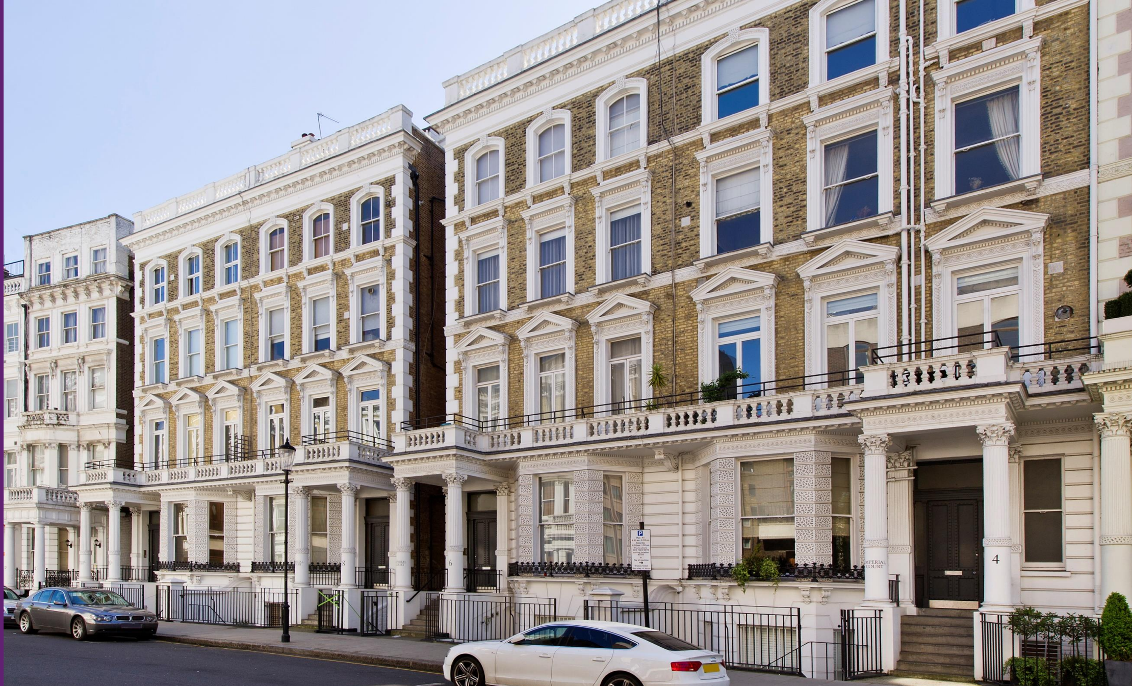
Imperial Court Kensington, W8