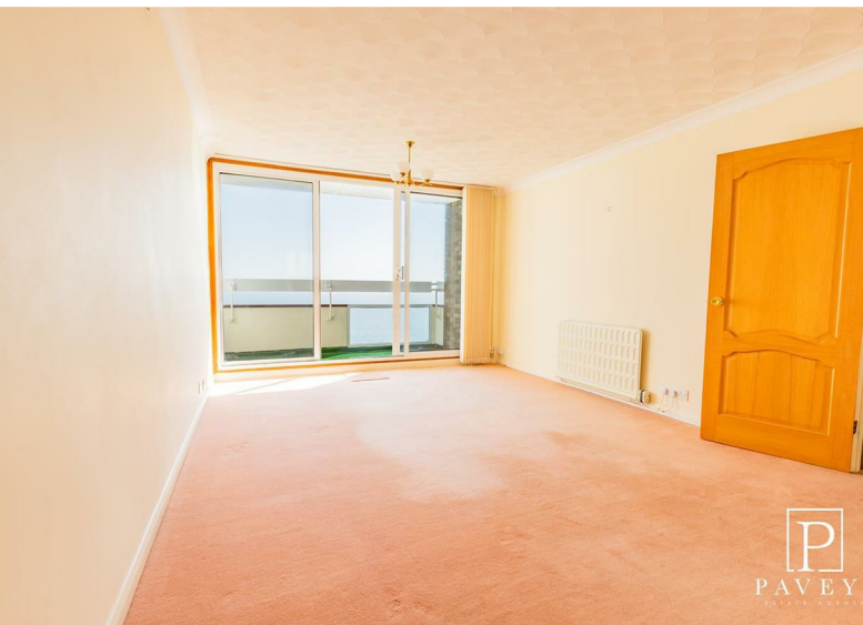
FOURTH FLOOR 727 sq.ft. (67.5 sq.m.) approx.

New to the market is this BRIGHT & SUNNY SEAFRONT APARTMENT with OPEN BALCONY & BREATHTAKING SEA & GREENSWARD VIEWS to be sold with NO ONWARD CHAIN. This 7th floor property comes complete with a garage and a share of the Freehold. Other key features include a lounge diner with doors to the seafront balcony, kitchen, two double bedrooms (all of which offer gorgeous panoramic sea views), cloakroom and shower room. Kings House is located on Frinton's Esplanade and is within easy reach of the gorgeous beach, Connaught Avenue, Frinton Railway Station and Frinton's popular sporting clubs including the cricket club, golf club and tennis club. We have keys to view! Call Paveys to arrange an appointment.