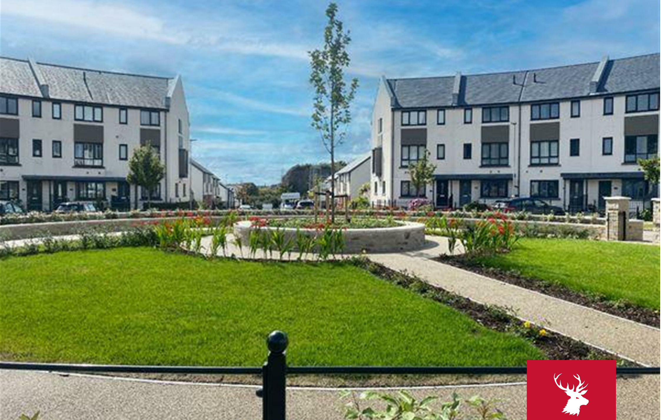
Apartment, plot 697, Saltram Meadow