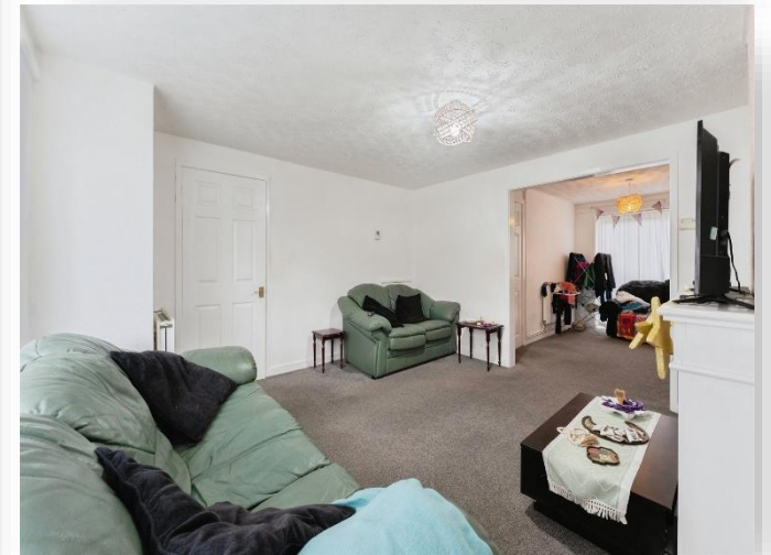
Davenham Close, Prenton, CH43 2LL