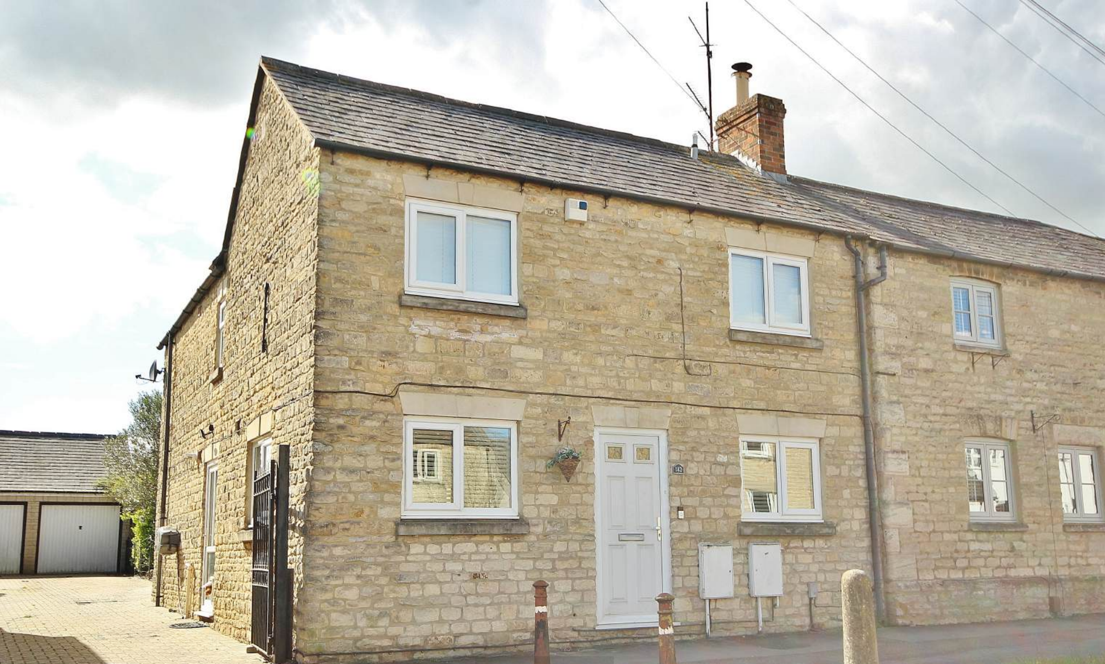
142 Newland Witney, Oxfordshire OX28 3JH