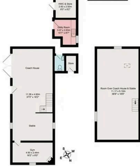
Garage and Stable