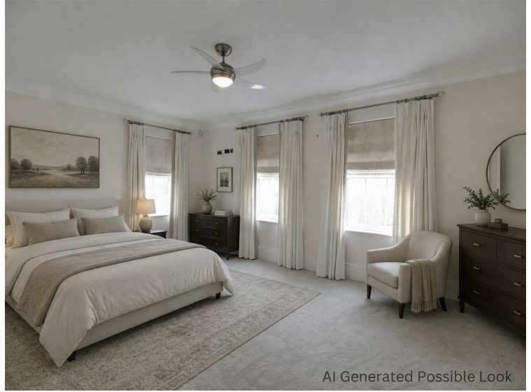
AI Generated Possible Look

20'2" x 16'2" approx (6.15m x 4.93m approx) Windows to both front and side elevations.