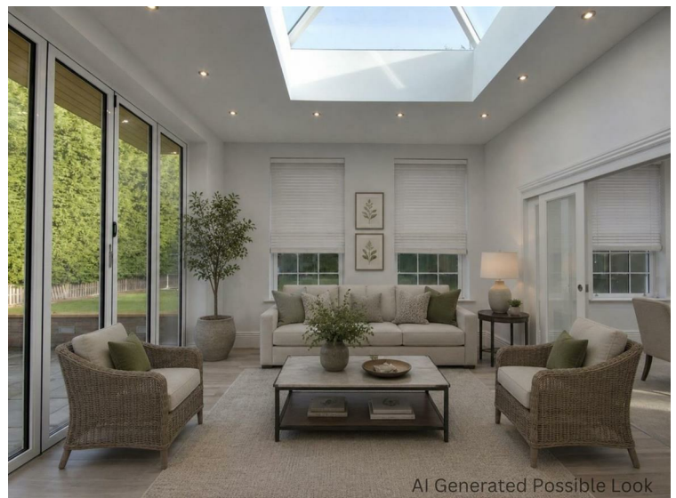
AI Generated Possible Look