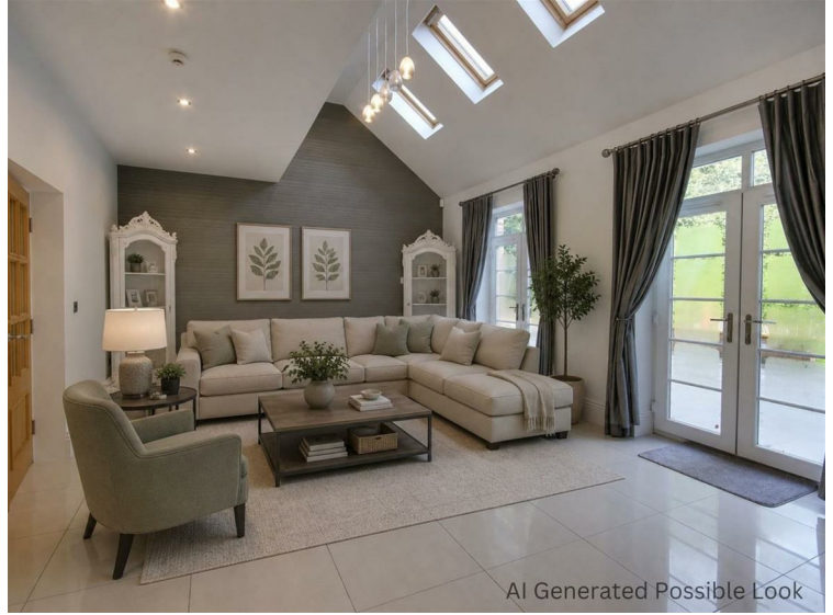
AI Generated Possible Look

Accessed via the central hallway, the day room provides access to the kitchen and beyond. There are a series of Velux windows to the vaulted ceiling and two pairs of double doors opening out to the rear terrace. The room is open plan in style through to the kitchen.