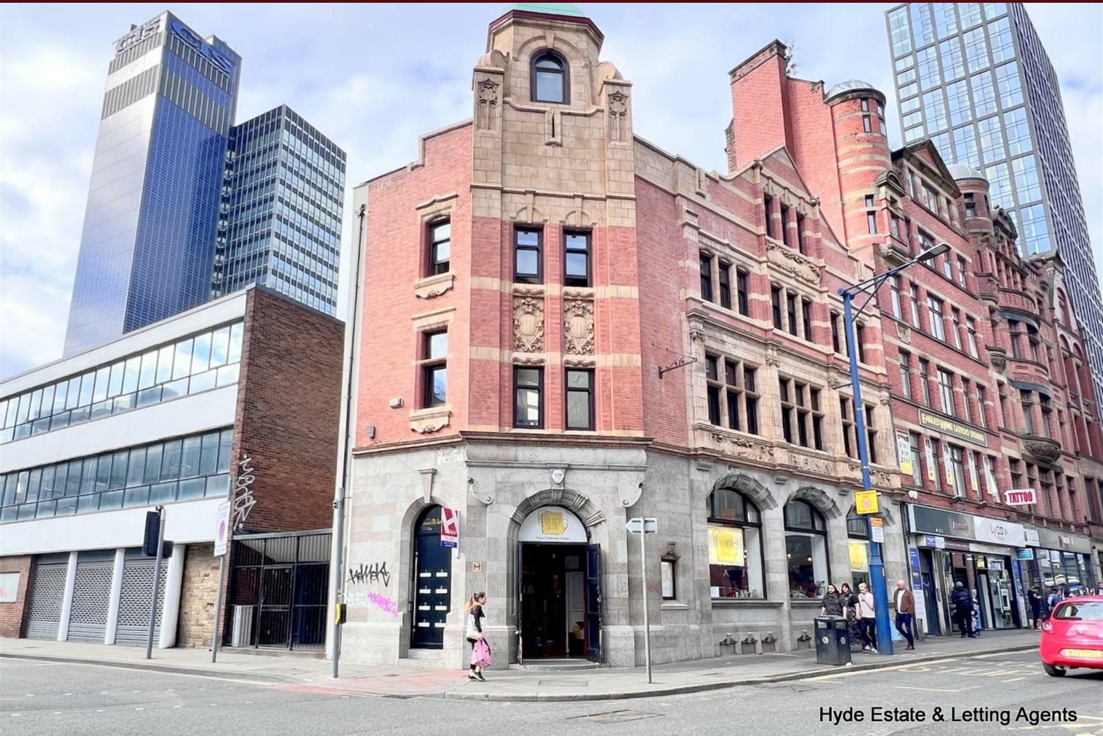
Hyde Estate & Letting Agents