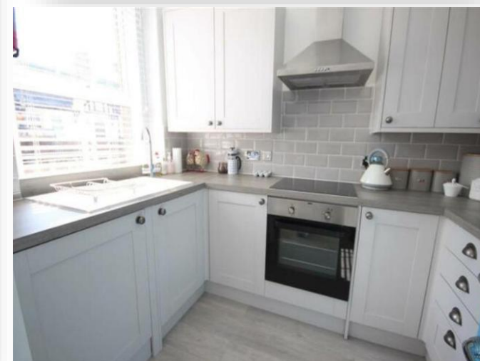
Summerland Avenue, Minehead, TA24 5BW