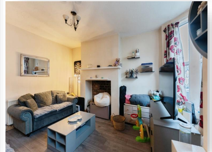
Harrowby Road, Birkenhead, CH42 7HS