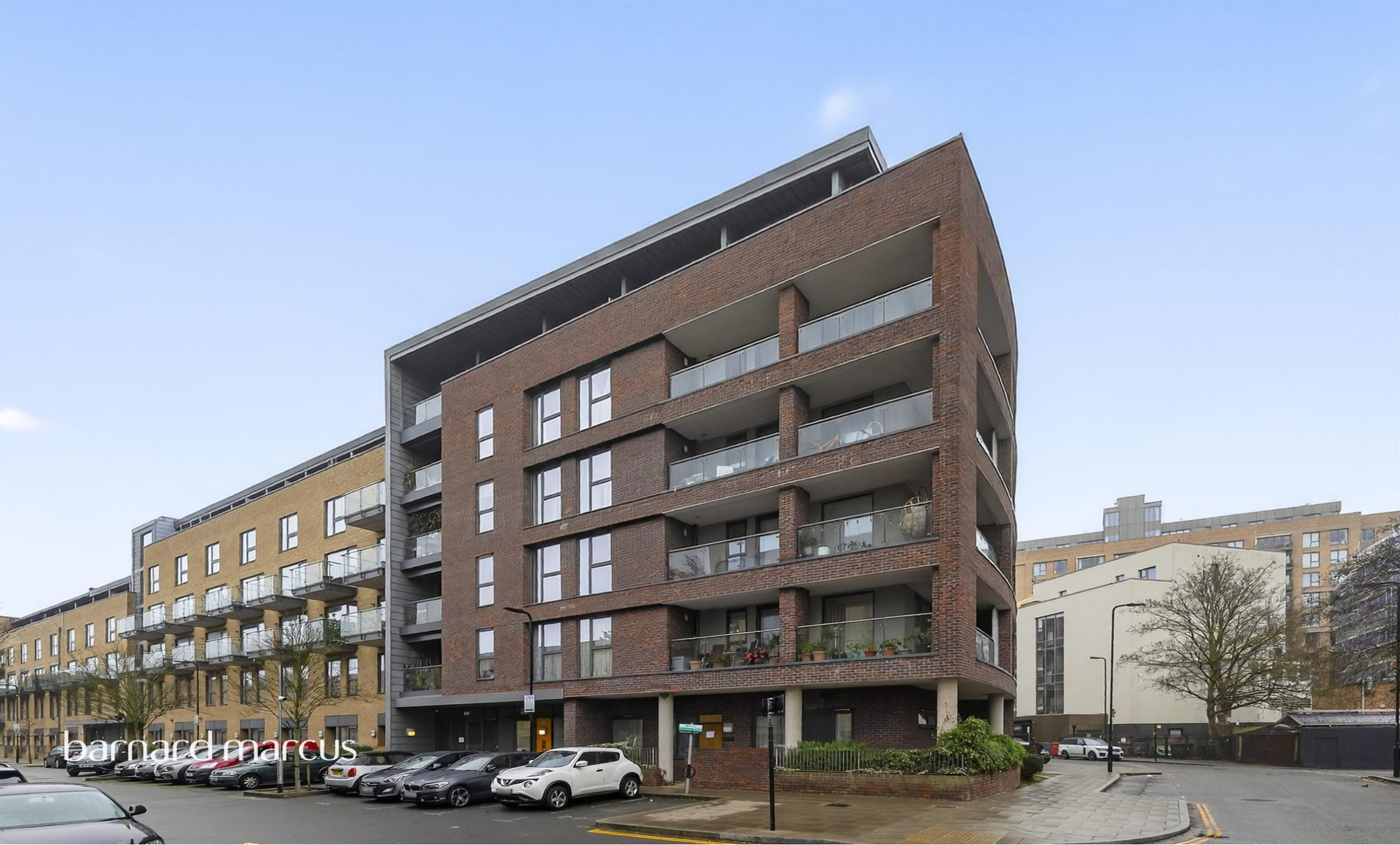
Ashmead House, Tewkesbury Road, London, W13 0DP