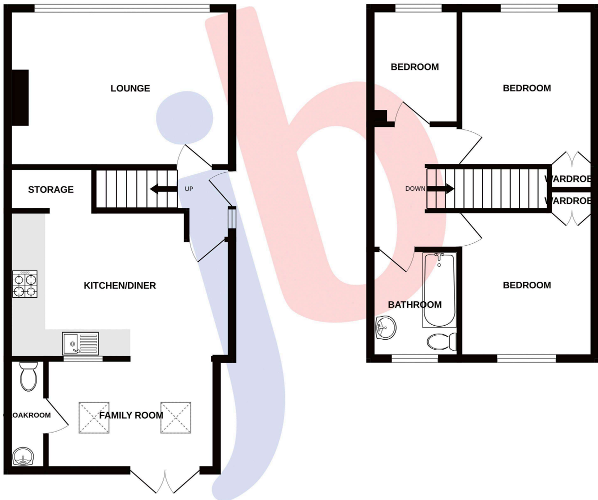
1ST FLOOR 397 sq.ft. (36.9 sq.m.) approx.

TOTAL FLOOR AREA : 908 sq.ft. (84.4 sq.m.) approx.