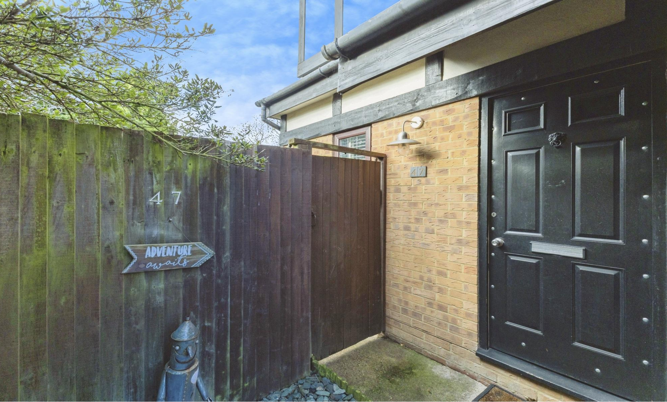
Ratby Close, Lower Earley READING RG6 4ER