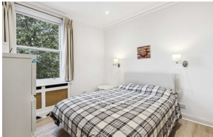
Pembridge Gardens, W2