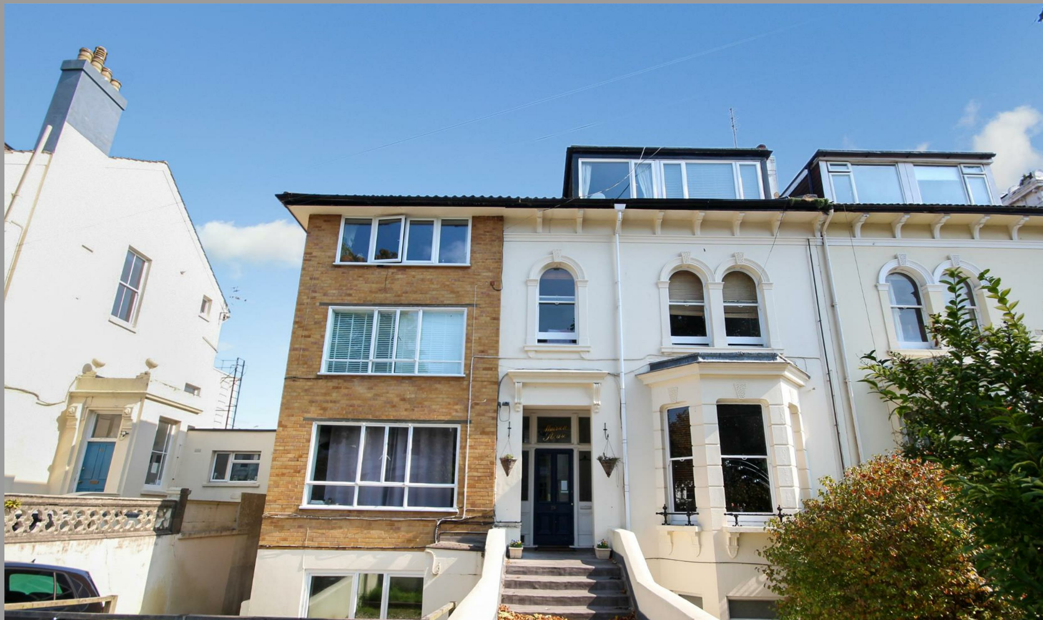
39, Clermont Terrace, Preston, Brighton BN1 6SJ