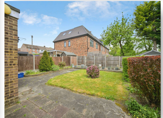
Sunnyside, Nazeing Waltham Abbey EN9 2RH