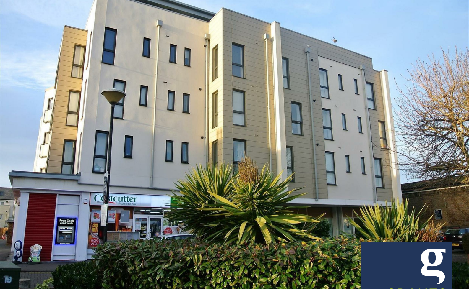
Victory Park Road, Addlestone, KT15 2FG