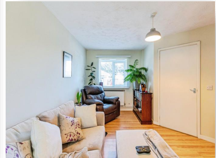
Fettledine Road, Irthlingborough Wellingborough NN9 5XF