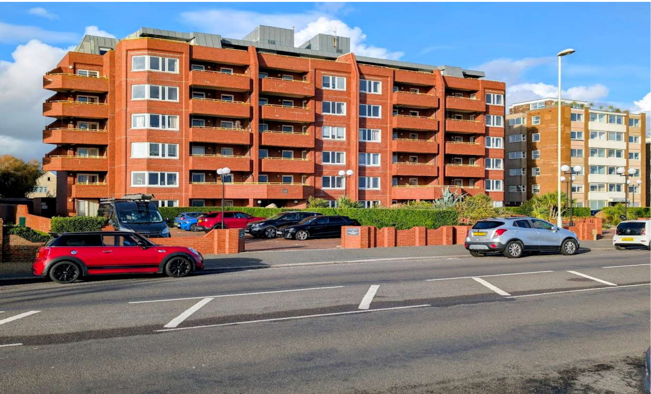
Capelia House West Parade, Worthing BN11 3RB