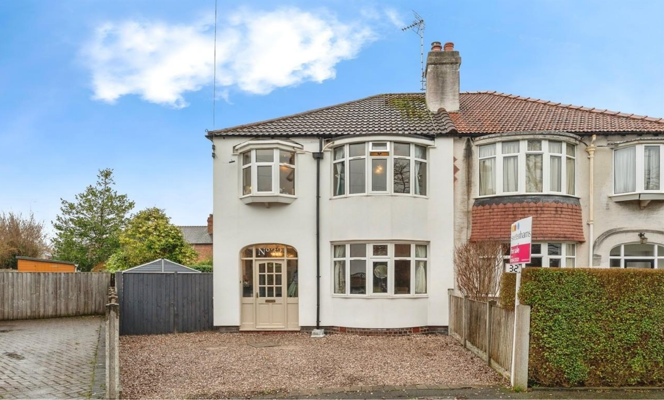
The Nook, Newton Chester CH2 2EJ