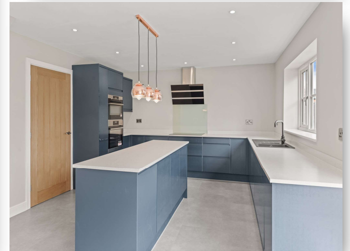
Woodcroft House High Gate, Helpringham Sleaford NG34 0RD