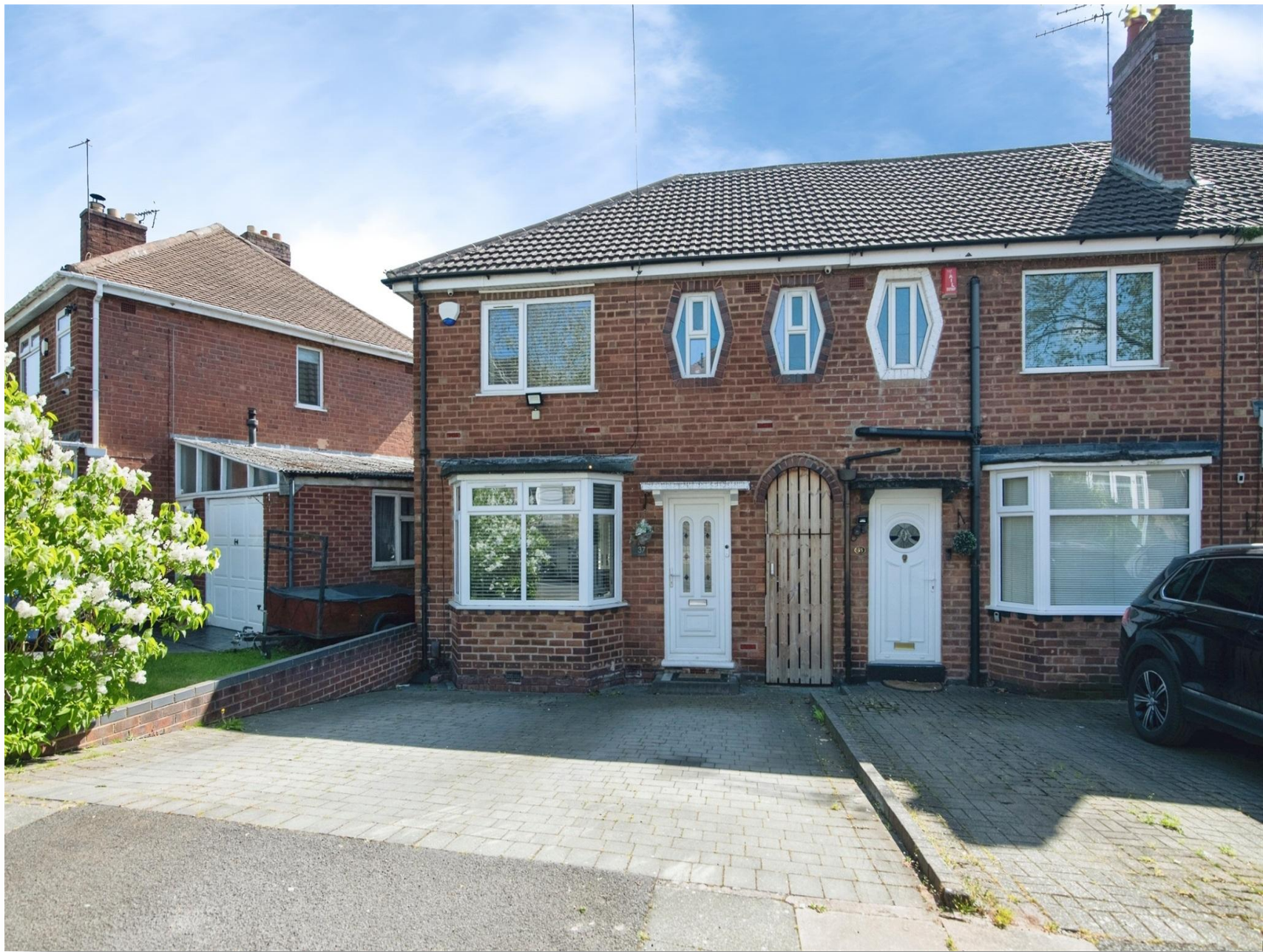
Boswell Road, Birmingham B44 8EH