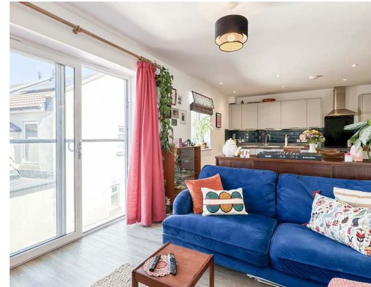
KITCHEN/ LIVING ROOM 22'10" x 14'4"