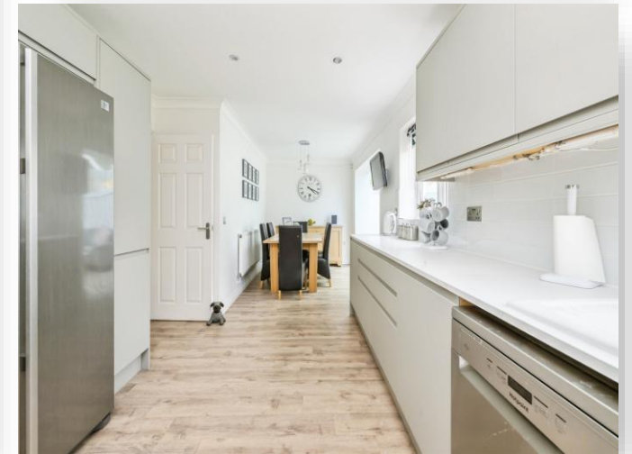
Alvis Drive, Yaxley Peterborough PE7 3AH