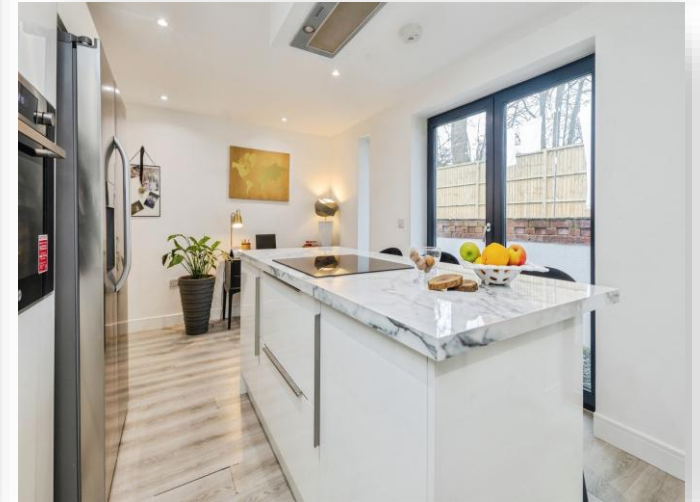
Villa Close, Branston Lincoln LN4 1LW