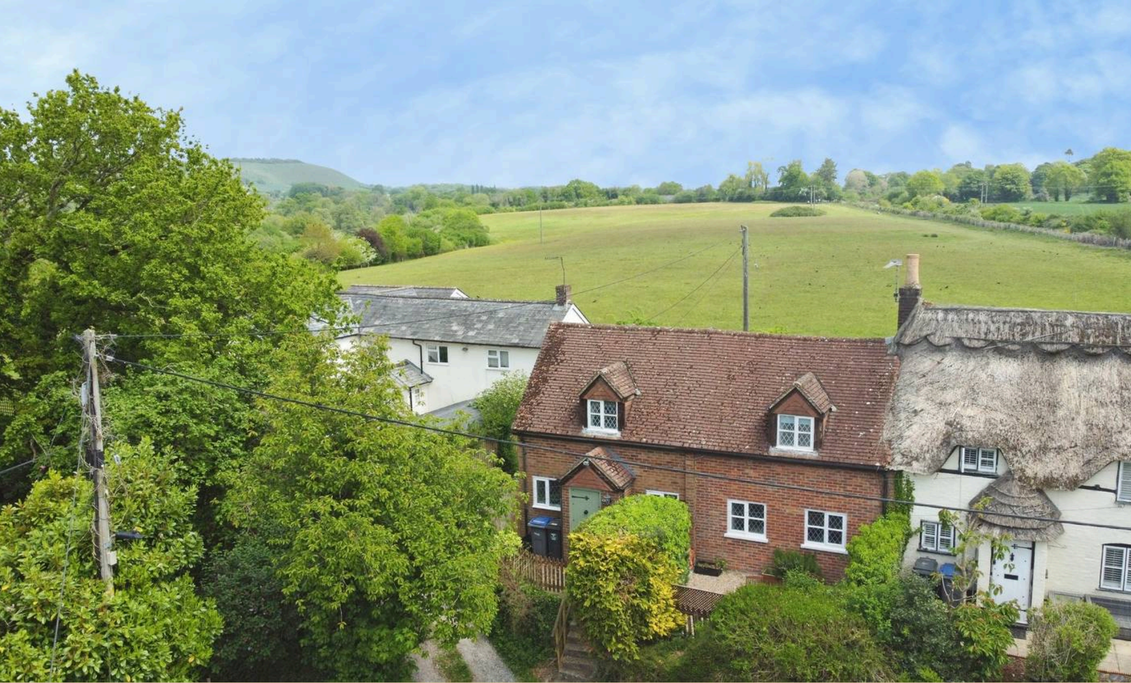
Knowle Cottage, Knowle £365,000