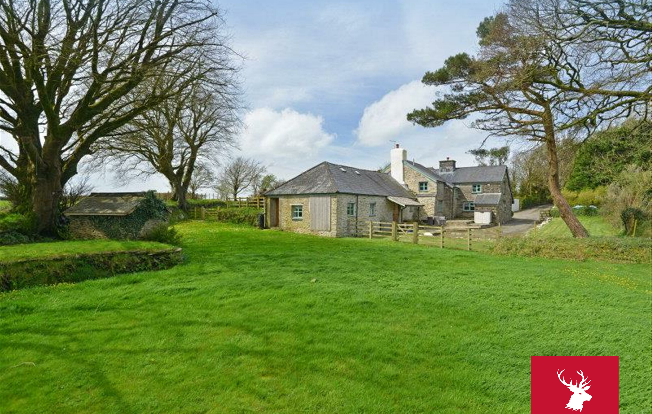
Inner Narracott & The Old Dairy