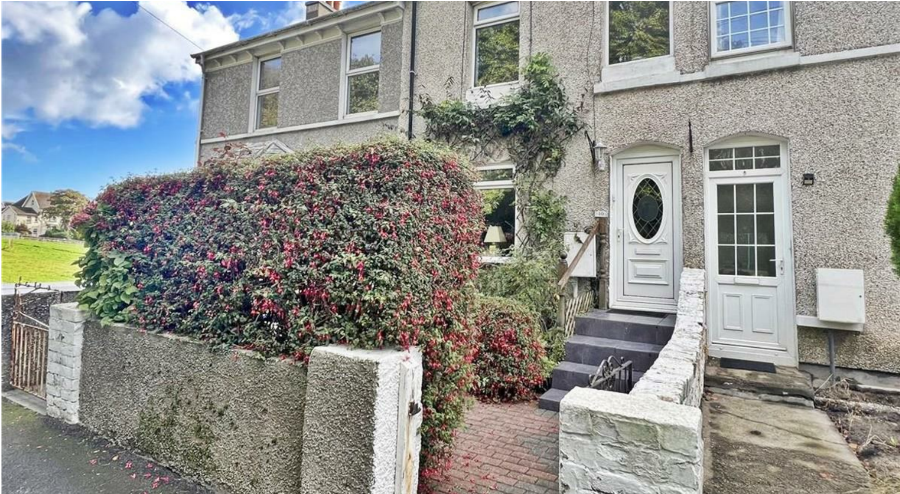
10 Poplar Terrace, Douglas, Isle of Man, IM2 4AR Asking Price £335,000