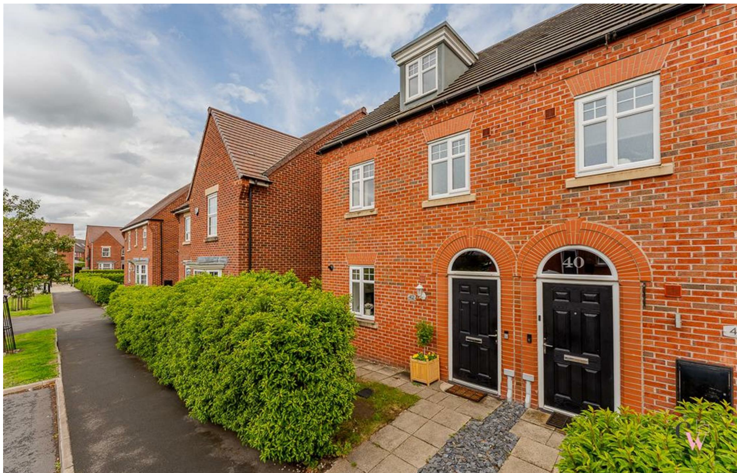
Western Way, Northwich CW8 4YL