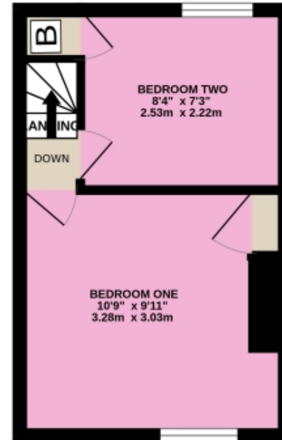
1ST FLOOR 180 sq.ft. (16.8 sq.m.) approx.