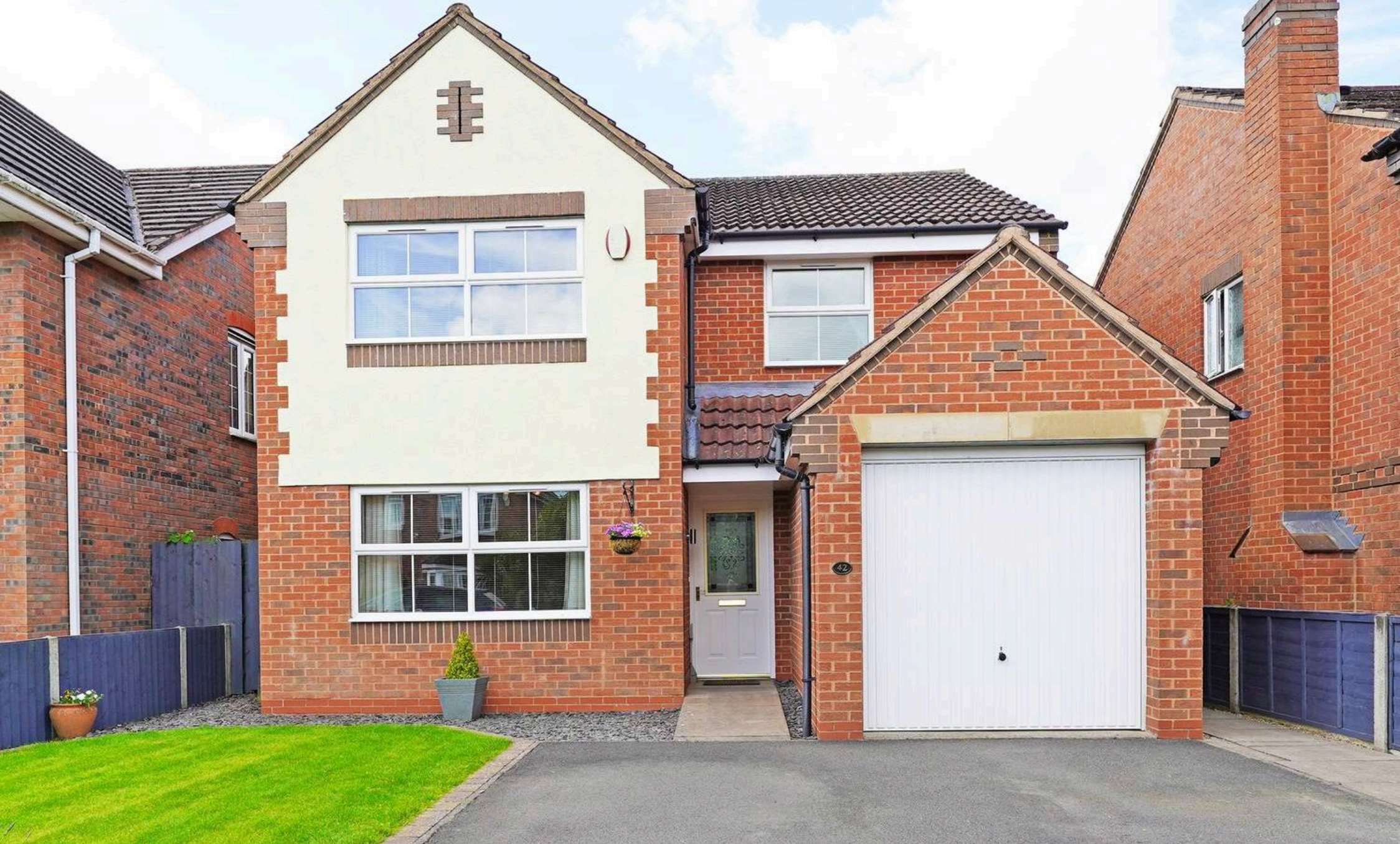
Grovefield Crescent, Balsall Common £529,950