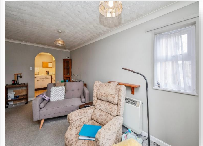
Angel Court, Cromer Road, North Walsham NR28 0UN