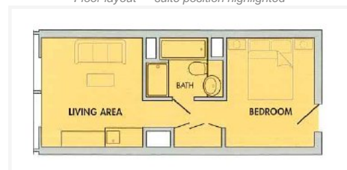
Suite floor plan

lesleyb@londonlink.co.uk | +44 7767 420 339 www.londonlink.co.uk