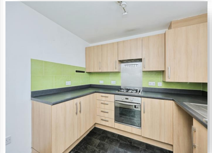
Fortress Road, Carbrooke Thetford IP25 6FP