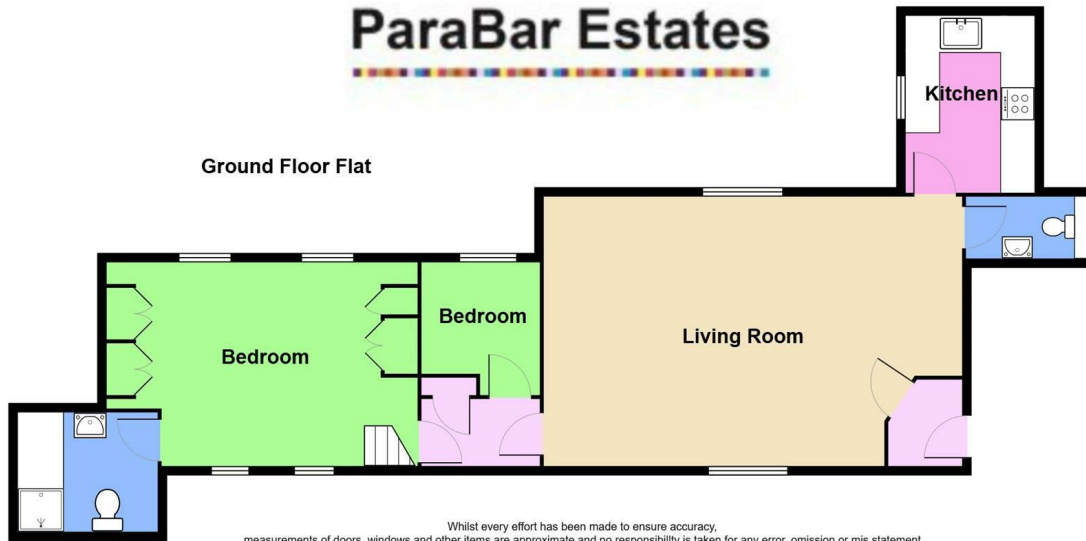
Ground Floor Flat

Whilst every effort has been made to ensure accuracy, measurements of doors, windows and other items are approximate and no responsibility is taken for any error, omission or mis statement. This plan is for illustrative purposes and so only be used as such.